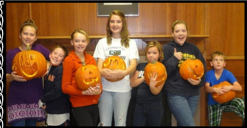
Cute faces – both human and pumpkin!!